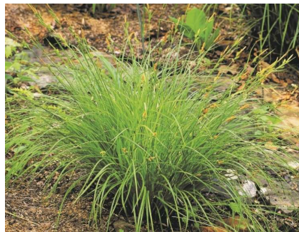
CAREX STRICTA TUSSOCK SEDGE