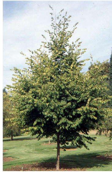
OSTRYA VIRGINIANA AMERICAN HOPHORNBEAM