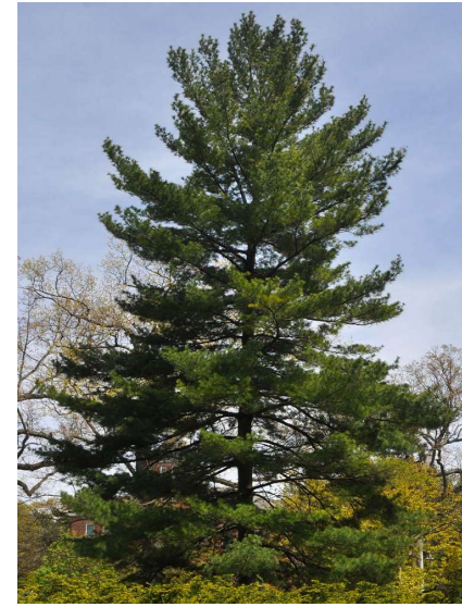
PINUS STROBUS EASTERN WHITE PINE