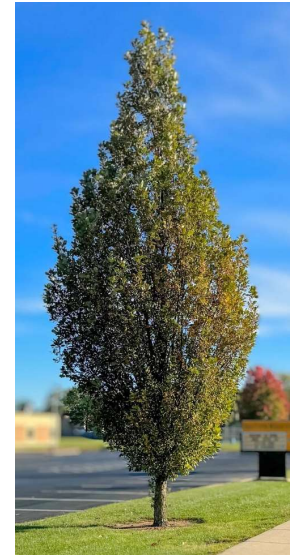
QUERCUS 'REGAL PRINCE' REGAL PRINCE OAK