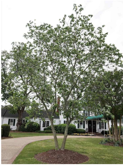
MAGNOLIA VIRGINIANA SWEET BAY MAGNOLIA