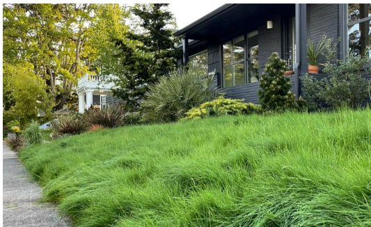
CREEPING RED FESCUE SLOPE SEED MIX *CONCEPT IMAGE SHOWN