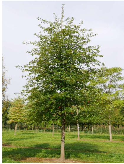
NYSSA SYLVATICA BLACK TUPELO