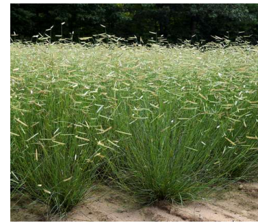
BOUTELOUA GRACILIS BLUE GRAMA GRASS

NOTE: Trees selected from the City of Pittsburgh's 'Approved Tree Species for Pittsburgh's Parks & Open Spaces' document dated February 26, 2020.