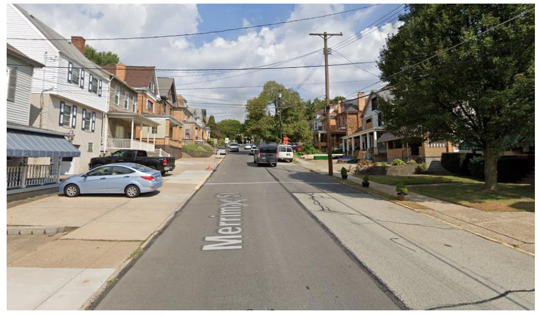
Merrimac Street between Woodruff and Grandview

Mount Washington, District 2 – Merrimac Street is a two-way street that serves as a collector for Mount Washington residents, providing access to Grandview Avenue and Sawmill Run Boulevard (SR 51) via Woodruff Street. Merrimac Street is owned by the City of Pittsburgh and the posted speed limit is 25 mph.