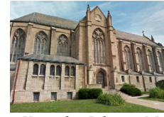
Karpeles Library Museum of Pittsburgh