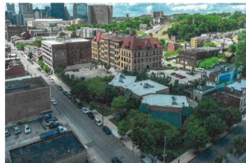
Our New Home 2027