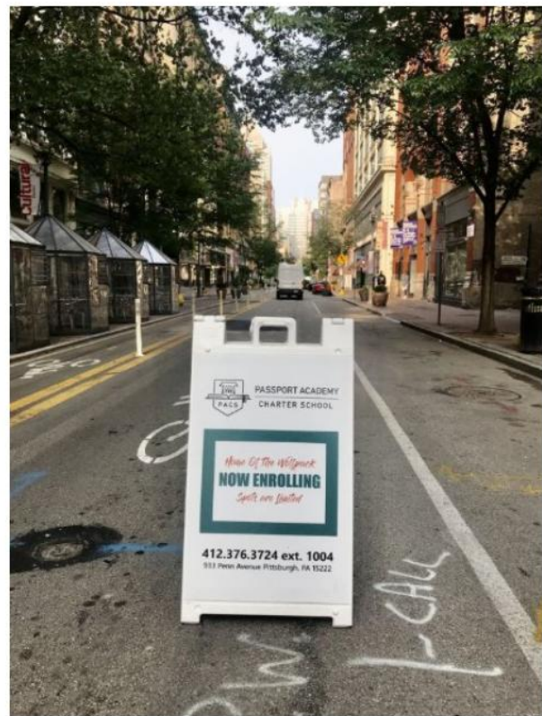
Previous Location 2019