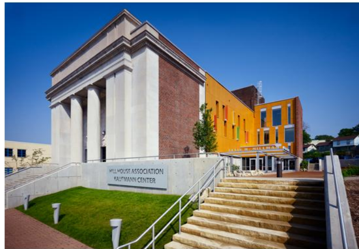
Original Location of the School