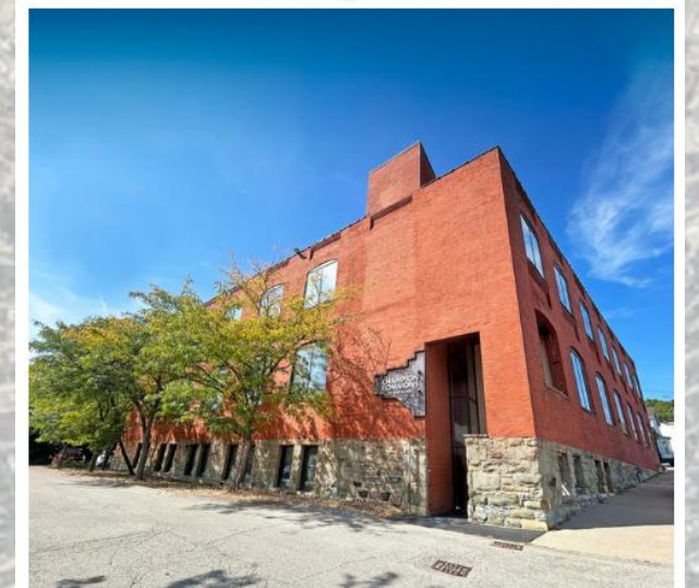
Temporary Space 2026