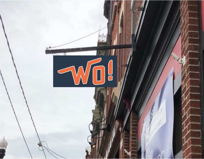
18" x 36" double sided hanging banner